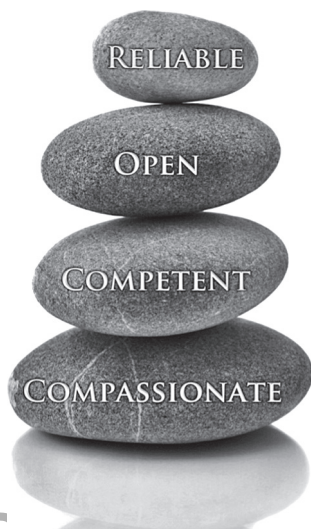
FIGURE 1.1 The ROCC of Trust

physician leaders who have achieved path-breaking healing by building trust with their patients and staff.